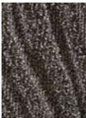
1288 Exotic 18-5203 TPX, 19-0515 TPX