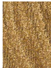
7020 Sparkling 16-1010 TPX, 16-1133 TPX