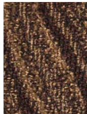
7099 Hot 18-1016 TPX, 19-1420 TPX