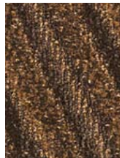
7109 Delicious 18-1016 TPX, 19-1015 TPX