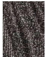
7025 Mega 18-0403 TPX, 19-4007 TPX