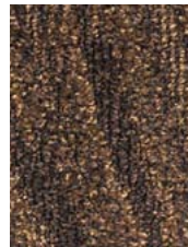
7111 Accidental 18-1016 TPX, 19-1015 TPX