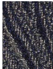
7093 Rich 18-0403 TPX, 19-4025 TPX