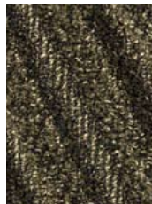
6119 Wicked 17-0517 TPX, 19-0515 TPX