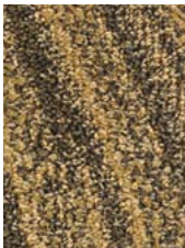
7081 Lucky 17-1019 TPX, 18-0403 TPX