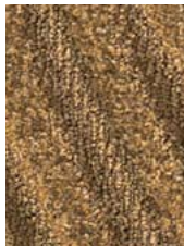
7087 Psuedo 15-1225 TPX, 17-1019 TPX