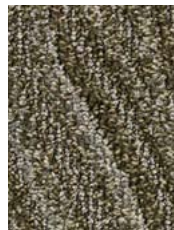
1378 Brilliant 18-5203 TPX, 19-0515 TPX