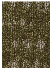
1378 Brilliant 18-5203 TPX, 19-0515 TPX