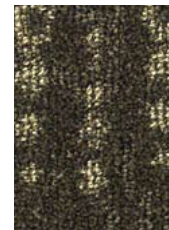
6119 Wicked 17-0517 TPX, 19-0515 TPX