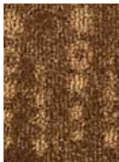
1291 Organic 16-1010 TPX, 18-1016 TPX