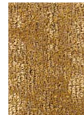
7020 Sparkling 16-1010 TPX, 16-1133 TPX