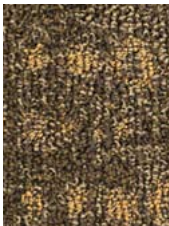
7081 Lucky 17-1019 TPX, 18-0403 TPX