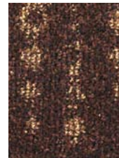
7099 Hot 18-1016 TPX, 19-1420 TPX