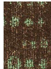
1457 Fresh 17-6212 TPX, 19-1015 TPX