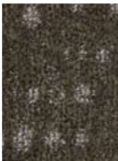
1288 Exotic 18-5203 TPX, 19-0515 TPX