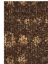
7109 Delicious 18-1016 TPX, 19-1015 TPX