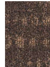
7111 Accidental 18-1016 TPX, 19-1015 TPX