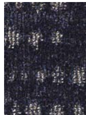
7093 Rich 18-0403 TPX, 19-4025 TPX