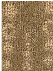
7087 Psuedo 15-1225 TPX, 17-1019 TPX