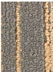
146 Sunstorm 16-1326, 16-6008 TPX