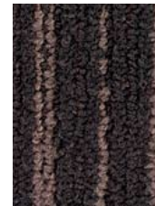
989 Path to Fuji 19-4203, 18-0513 TPX