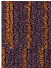
864 Tranquil Earth 19-3905, 18-1033 TPX