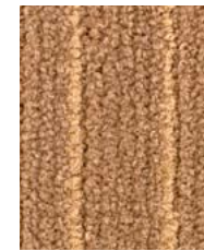
821 Chasen 17-1028, 16-1326 TPX