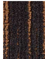
988 Brush & Ink 19-4203, 18-0933 TPX