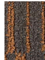
678 Fawns of Nara 18-0510, 18-1033 TPX