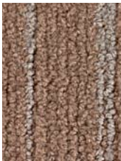
846 Crushed Rock 17-1118, 16-0207 TPX