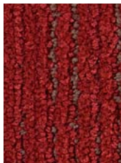
378 Lacquerware 19-1338, 18-0513 TPX