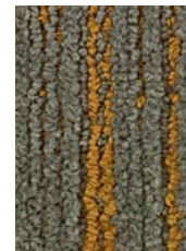
641 Tea Garden 16-6008, 18-0840 TPX