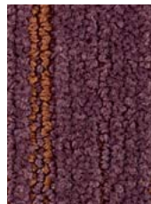
468 Gingered Plum 19-1619, 19-1430 TPX