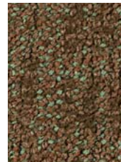
56152 Patrician Teak 18-1016 TPX