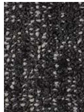
26021 Black Caviar 19-4007 TPX