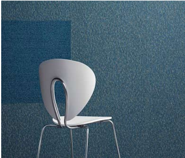
Idle Chatter Modular