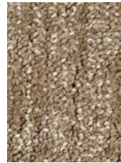
56024 Upward Taupe 17-1310 TPX