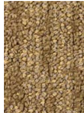
84050 Sandstone 17-1118 TPX