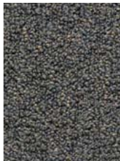
16012 Skyscraper 18-5203 TPX