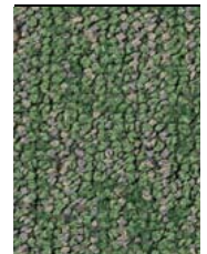
66027 Georgian Bay 17-6212 TPX