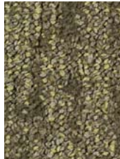
76151 Pewter Green 17-0517 TPX