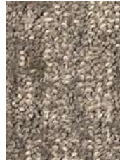
76156 Subway Rain 16-1107 TPX