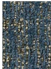
55002 Waterway 18-4011 TPX