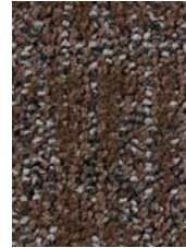
86149 Bronze Statue 19-1015 TPX