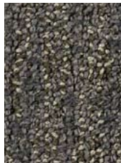
16124 City Street 18-0601 TPX