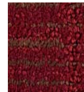
377 Spirit Festival 19-1338 TPX