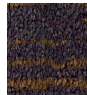
496 Paradise Park 19-3903 TPX