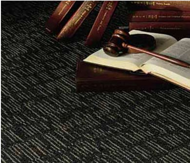
Grand Avenue Modular