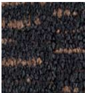
997 Union Station 19-0000 TPX