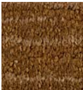
872 Crown Center 18-0830 TPX