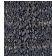
969 Science City 18-0403 TPX