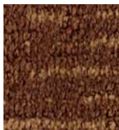
898 Cow Town 18-1027 TPX