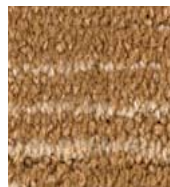
761 Quality Hill 16-1326 TPX