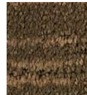
681 Powell Gardens 18-0426 TPX