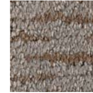
958 Hereford Building 14-6408 TPX