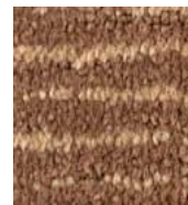
831 Cube 16-1315 TPX