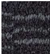
999 18th & Vine 19-1102 TPX