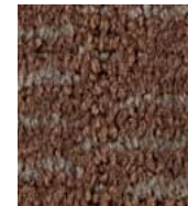
879 The Plaza 19-1020 TPX