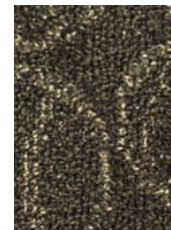
6119 Wicked 17-0517 TPX, 19-0515 TPX