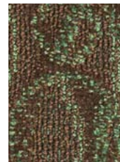
1457 Fresh 17-6212 TPX, 19-1015 TPX