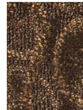
7109 Delicious 18-1016 TPX, 19-1015 TPX