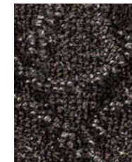
7025 Mega 18-0403 TPX, 19-4007 TPX