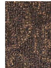
7111 Accidental 18-1016 TPX, 19-1015 TPX