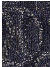
7093 Rich 18-0403 TPX, 19-4025 TPX