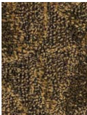
7081 Lucky 17-1019 TPX, 18-0403 TPX