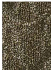
1378 Brilliant 18-5203 TPX, 19-0515 TPX