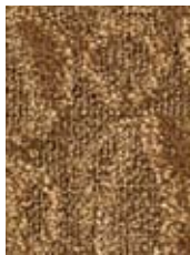
1291 Organic 16-1010 TPX, 18-1016 TPX