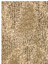
7087 Psuedo 15-1225 TPX, 17-1019 TPX