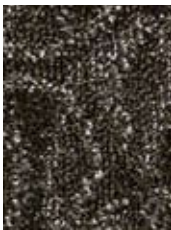
1288 Exotic 18-5203 TPX, 19-0515 TPX