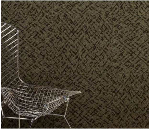
Electric Strings Modular