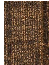
7109 Delicious 18-1016 TPX, 19-1015 TPX