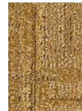
7020 Sparkling 16-1010 TPX, 16-1133 TPX