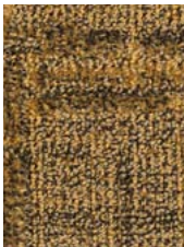
7081 Lucky 17-1019 TPX, 18-0403 TPX