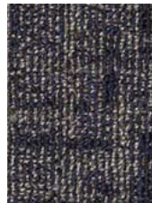
7093 Rich 18-0403 TPX, 19-4025 TPX