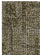
1378 Brilliant 18-5203 TPX, 19-0515 TPX