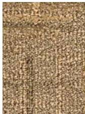
7087 Psuedo 15-1225 TPX, 17-1019 TPX