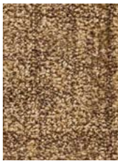
1291 Organic 16-1010 TPX, 18-1016 TPX