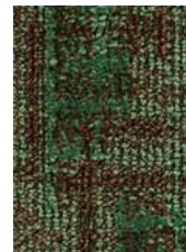
1457 Fresh 17-6212 TPX, 19-1015 TPX