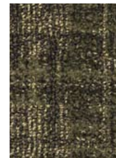
6119 Wicked 17-0517 TPX, 19-0515 TPX