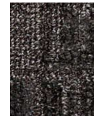
7025 Mega 18-0403 TPX, 19-4007 TPX