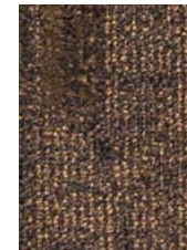
7111 Accidental 18-1016 TPX, 19-1015 TPX