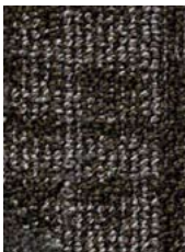
1288 Exotic 18-5203 TPX, 19-0515 TPX