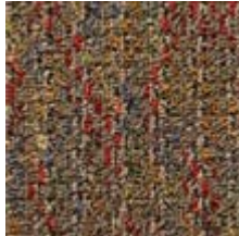
872 Fire Wall