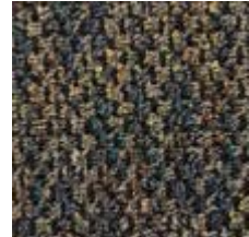
889 Eco Chic