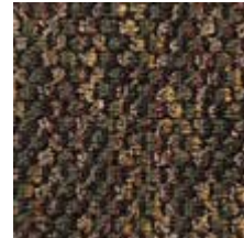
879 Earth Source