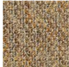
841 Heat Cell