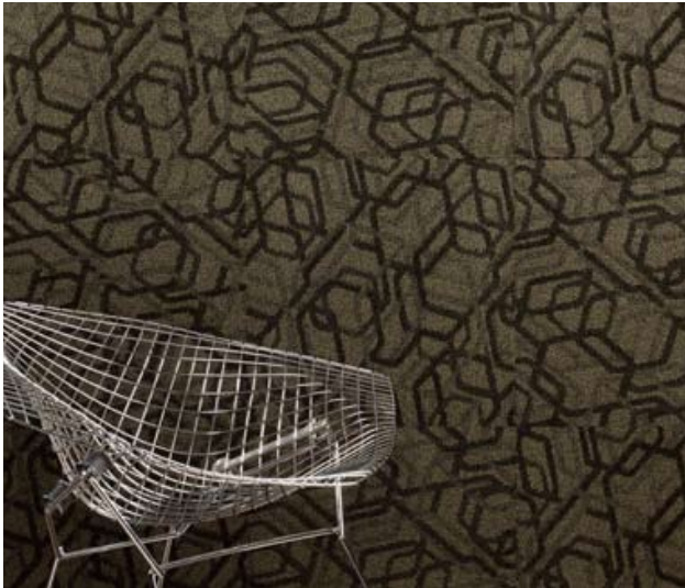
Baseline Riff Modular