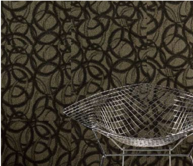
Atmospheric Loop Modular